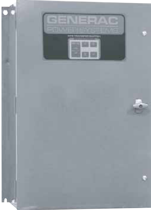
200 Amp HTS NEMA 1